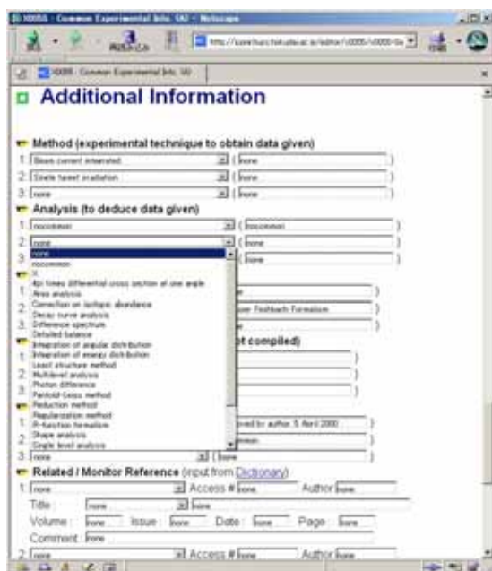
HENDEL (Nuclear data editor) http://jcprg.hucc.hokudai.ac.jp/editor/