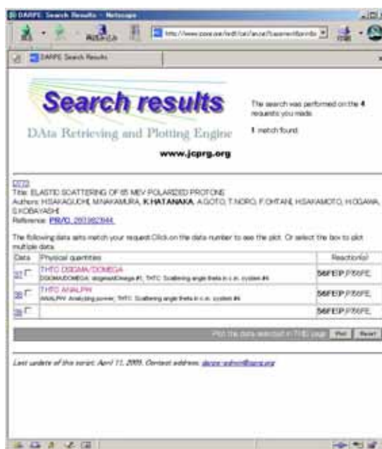
DARPE (NRDF search / plot) http://www.jcprg.org/nrdf/